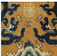
Ceremonial carpet, 1st half of the XVII century (Ming Dynasty), China 111x111 cm, MATAM Collection *

This sizable carpet with stylized lotus flowers, buds, leaves and branches, is one of the rarest currently known specimens made in the imperial style of the Ming dynasty. It was probably created expressly for one of the royal palaces.