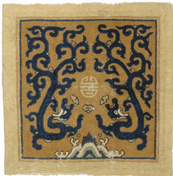
Ceremonial carpet China, 1st half of the XVII century (Ming Dynasty)